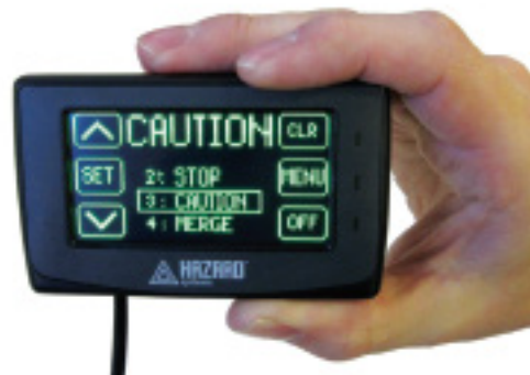
O-LED touchscreen controller